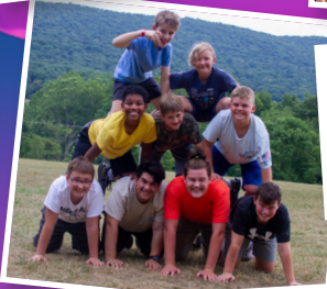
"God showed up during the testimonies at the cabins."