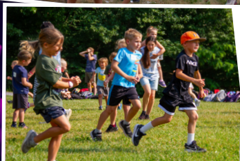
"God helped me with my anxiety."