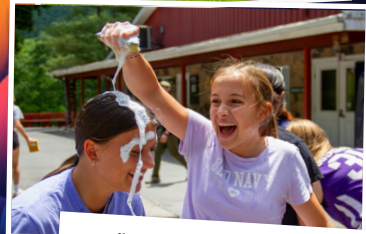
"God led more people to accept Him as their Savior."