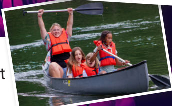
"I saw my best friend get saved!"