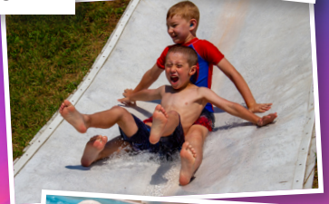
"When I was scared or shy, God gave me courage."